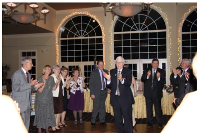
Having fun with "YMCA"