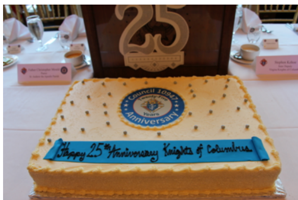
25 th Anniversary Cake – Yum!

Below are some photos that captured the festivities.